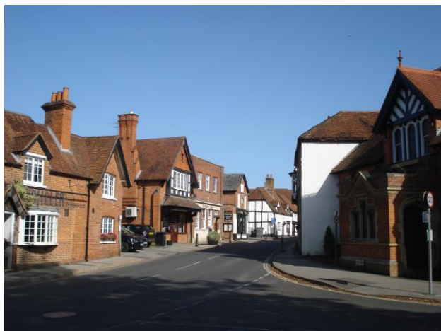
Goring, one of several riverside villages covered in the forthcoming volume on the South Oxfordshire Chilterns (Volume XX). Its parish stretched up into the Chiltern hills

The national closure of archives inevitably affected our work schedules this year, but the team has risen to the challenge, rescheduling immediate plans and concentrating between April and September on online resources, and on analysis and writing up of research already completed. Despite the disruption, this has allowed us to keep to our planned publication schedule (see below and opposite), provided that the current very limited access to archives continues to improve.