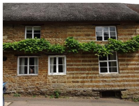
Banded stonework in Hook Norton

The Trust was set up in 1997, to raise funds towards the completion of the Victoria County History of Oxfordshire and its 'gold standard' histories of every town and parish in the historic county. The research and writing is carried out by a team of four professional full-time historians. In partnership with Oxfordshire County Council and the Universities of Oxford and London a total of 19 volumes out of 23 has been published so far, with another nearing completion, and work on Volume XXI well under way. The Trust is currently raising three quarters of the project's annual funding through donations from individuals, institutions and trusts.