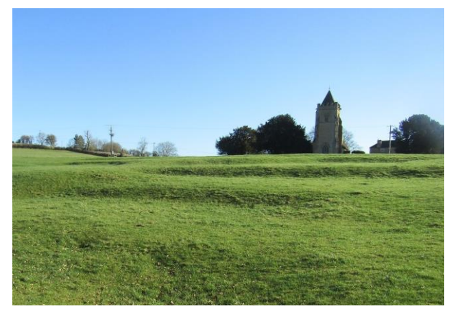
Earthworks west of Salford church, marking the formal gardens of the 17th- and 18th-century Salford House (demolished 1810)

Work on the rural parishes in this volume is now virtually complete, with five new drafts added to the VCH website (address overleaf). Those are Great Rollright and Little Rollright (the latter best known for the prehistoric Rollright Stones); Salford (named from an early medieval saltway running through the parish); Swerford with Showell (site of a riverside motte-andbailey castle and medieval park); and a revised draft on Hook Norton (an Anglo-Saxon royal centre now best known for its brewery and its 19th- and 20th-century ironstone extraction, still visible in the landscape). Over Norton (historically part of Chipping Norton parish) will be added later.