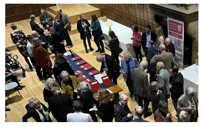
The launch of VCH Oxfordshire XX (The South Oxfordshire Chilterns) at Shiplake College, 18 March 2022.

Our South Chilterns volume (VCH Oxfordshire XX) was published in February, and launched at a well-attended event held in Shiplake College (near Henley) on 18 March. The 509-page volume (which includes 117 maps, plans, and other illustrations) covers a dozen ancient parishes in the south-east of the county, contained within a large southward loop of the Thames. Caversham, uniquely, became a densely settled suburb of Reading (across the river) from the late 19th century, although the area as a whole remains predominantly rural. The volume completes our coverage of that part of the county, following our earlier volumes on the Henley-on-Thames area (2011) and Ewelme Hundred (2016).