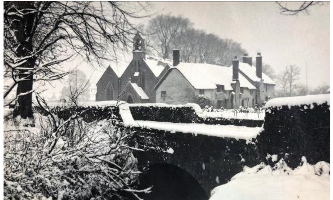
St Peter's Church, Williton c. 1910