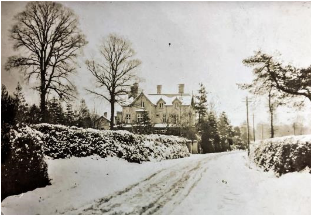
Thornfalcon Cottage and a little-used A358, December 1909

While we are so concerned about the effects of climate change on our world and especially on Somerset, much of which is low-lying, it is interesting to note some of the weather events of the past. Bitter winters have frequently been experienced and before the First World War there was a particularly cold and snowy winter in 1909 – 1910. Familiar scenes were transformed under a blanket of white.