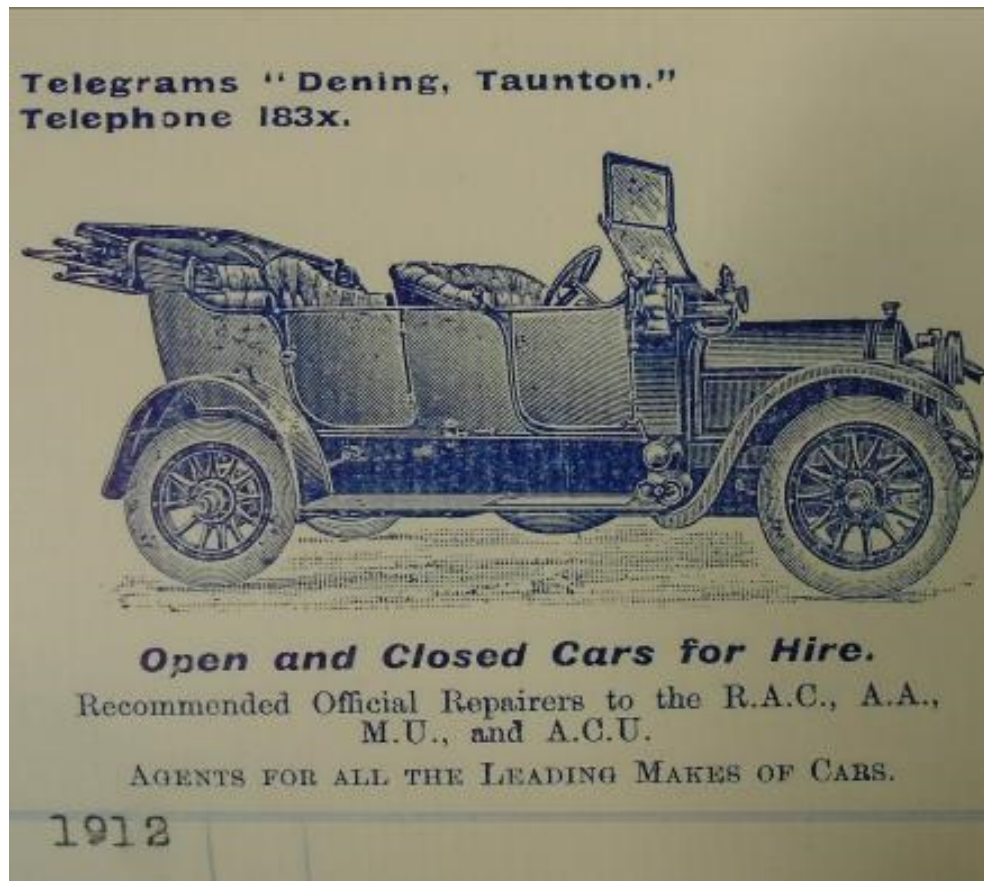
Billhead in use between c. 1909 and 1912