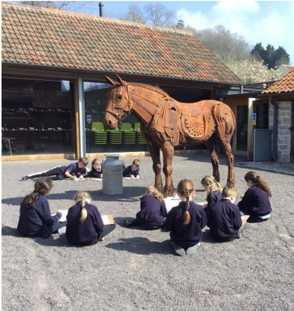
Drawing in the courtyard