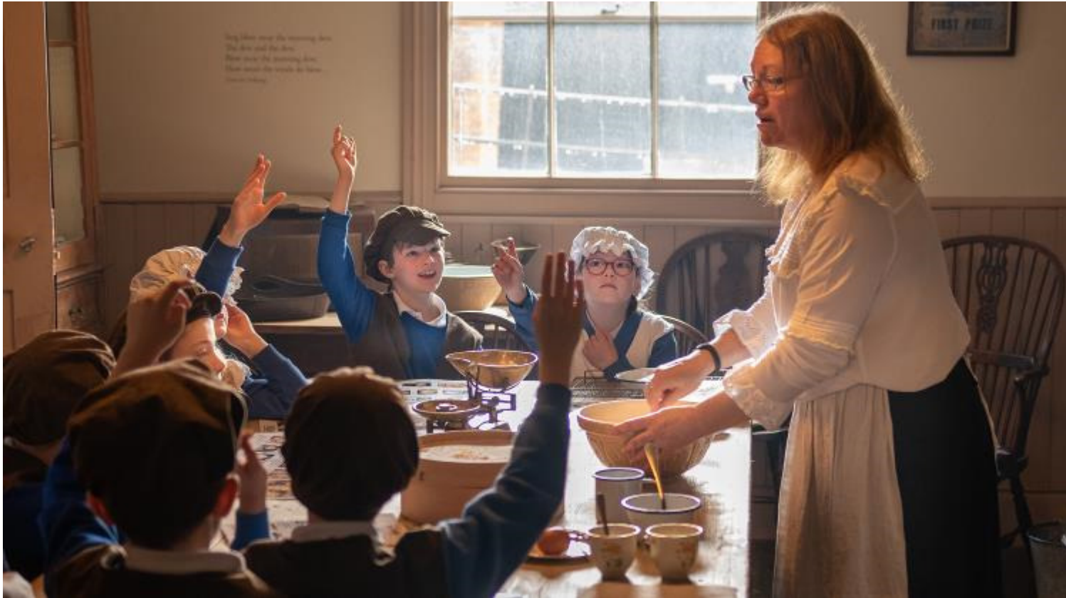
Baking in the farmhouse kitchen