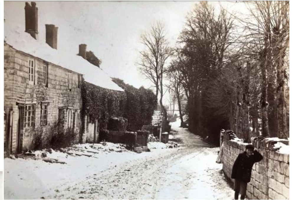
North Curry, December 1909

Heavy snow in the Blackdowns area in May 1909 might have been a sign of things to come. It began snowing in Somerset in November, not only on the hills, which were under deep snow by Christmas, but even on the coast. The council at Weston super Mare had to clear roads in the town. By December much of Somerset was under snow.