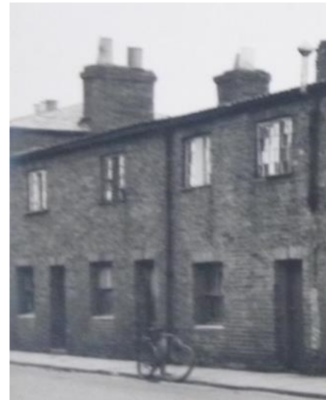
1820s housing in King Street, Taunton

were employed in keeping the rooms clean and tidy and fetching and carrying. As they got older they could wind silk on the quills for the shuttles and assist the weavers, often their own mothers. Silk weaving was mainly done by married women and it was poorly paid. However, women sometimes had the option of renting a loom and working at home. Some had to share a loom with sisters or mothers reducing the amount produced but allowing shared child care. If a loom stood in rented accommodation the charge was about 1s . a week for the space. The skilled and better paid work was throwing, usually done by young unmarried women. A mill owner noted that they brought meat to cook in the mill kitchen for the midday meal but the married women went home for kettle broth, hot water on vegetable peelings, scraps, rinds and dry crusts, or brought treacle sandwiches.