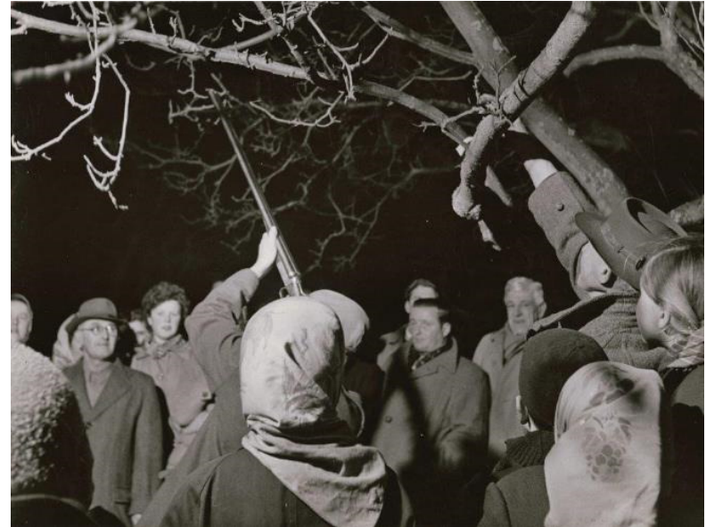
Wassail at Carhampton later 20th century

In Bicknoller wassailing on Old Twelfth Night continued until at least 1870. Dunster's wassail is thought to have begun in the late nineteenth century by the chemist Samuel Ell and continued until the 1930s. At nearby Minehead one was held in the 1900s. 'The Black (or 'girt') Dog of Langport' occurs in a wassail first printed in 1895 and was recorded in a variant version by Cecil Sharp in 1909.