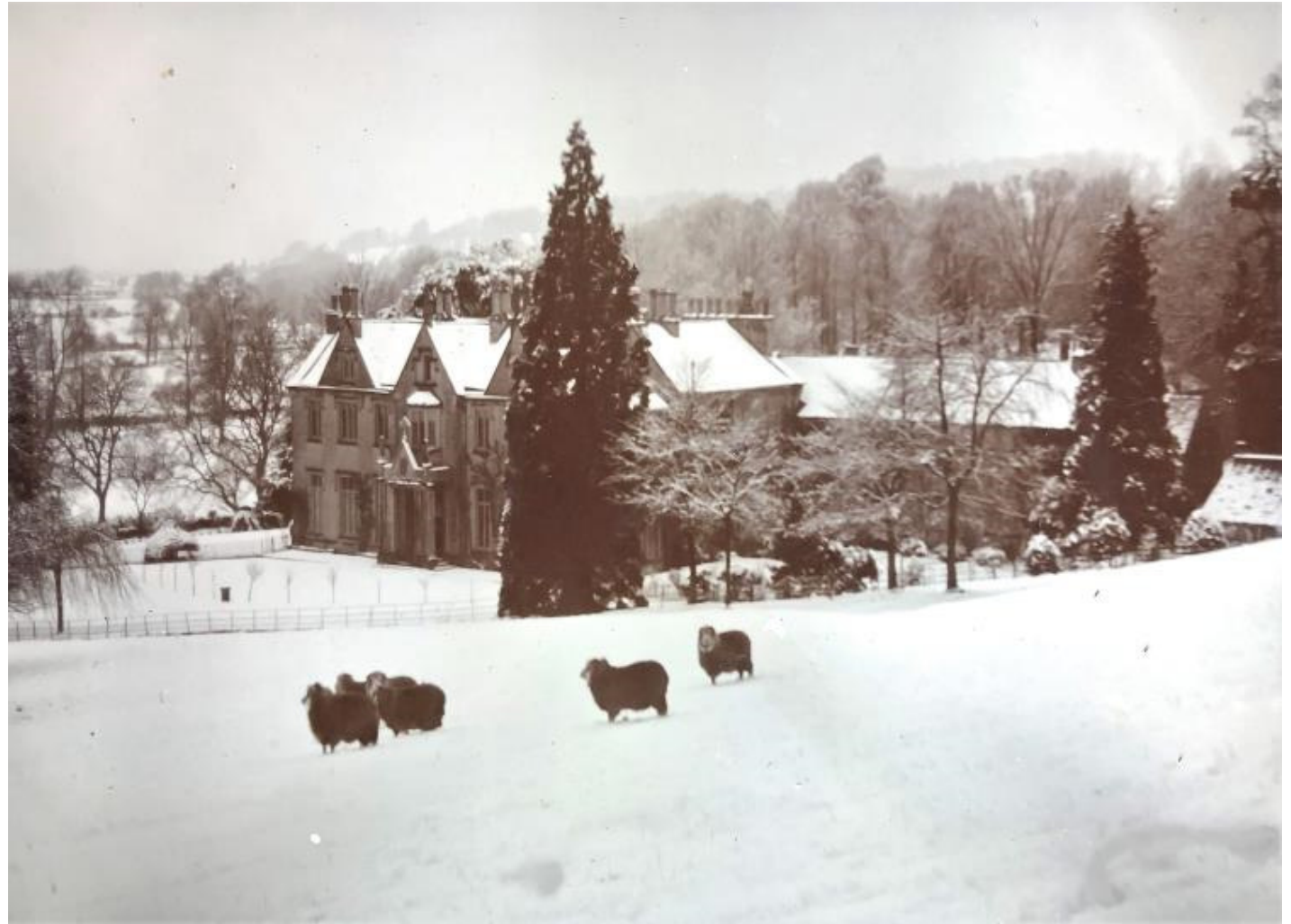
Knowle Hall, Bawdrip c. 1910