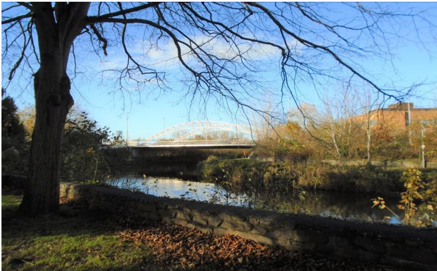
Tangier Way bridge, Taunton