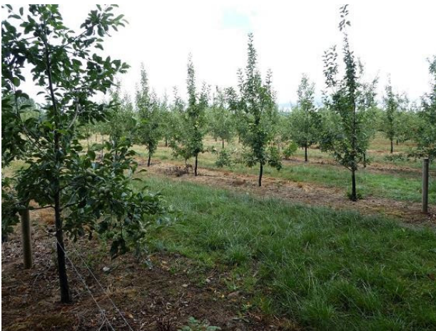
Cider apple orchard in Somerset

There are several references to Somerset wassails in the pages of the VCH. In the south-east of the county the parish of Yarlington had a wassail song, possibly dating from the 17th century, and Yarlington Mill is a variety of cider apple raised by the miller in the late 19th century.