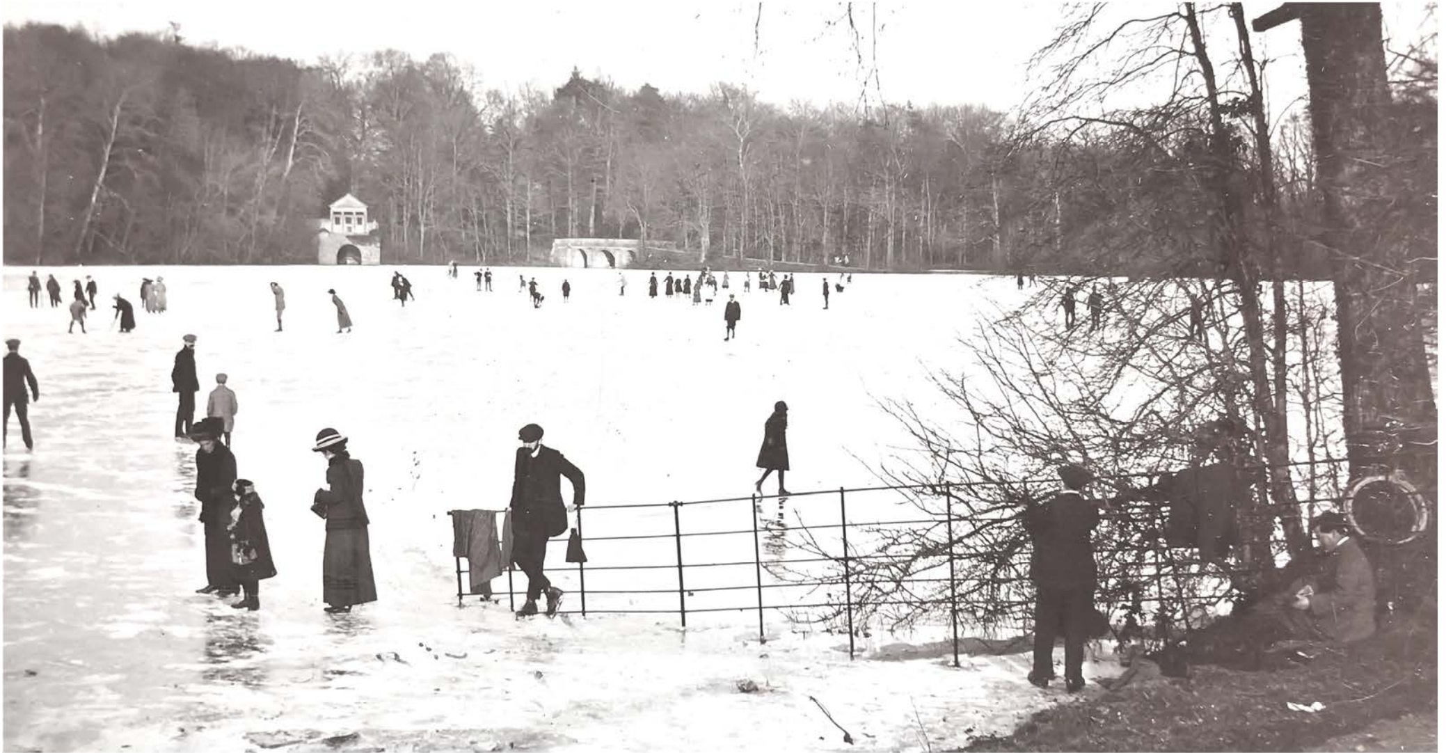
Skating on the lake at Orchardleigh, c. 1910

February saw very heavy snowfall and bitter cold throughout Britain, in Scotland it was the heaviest snow for 25 years. Rivers were frozen, which had not been iced over since the 1850s. There were blizzards and record hard frosts. East Somerset suffered disruptive snowfalls in early February 1910. There were warnings not to let hens eat snow and to shelter young horses. In an era of increasing technology the vulnerability of power lines, telephone wires and tram services was all too evident.