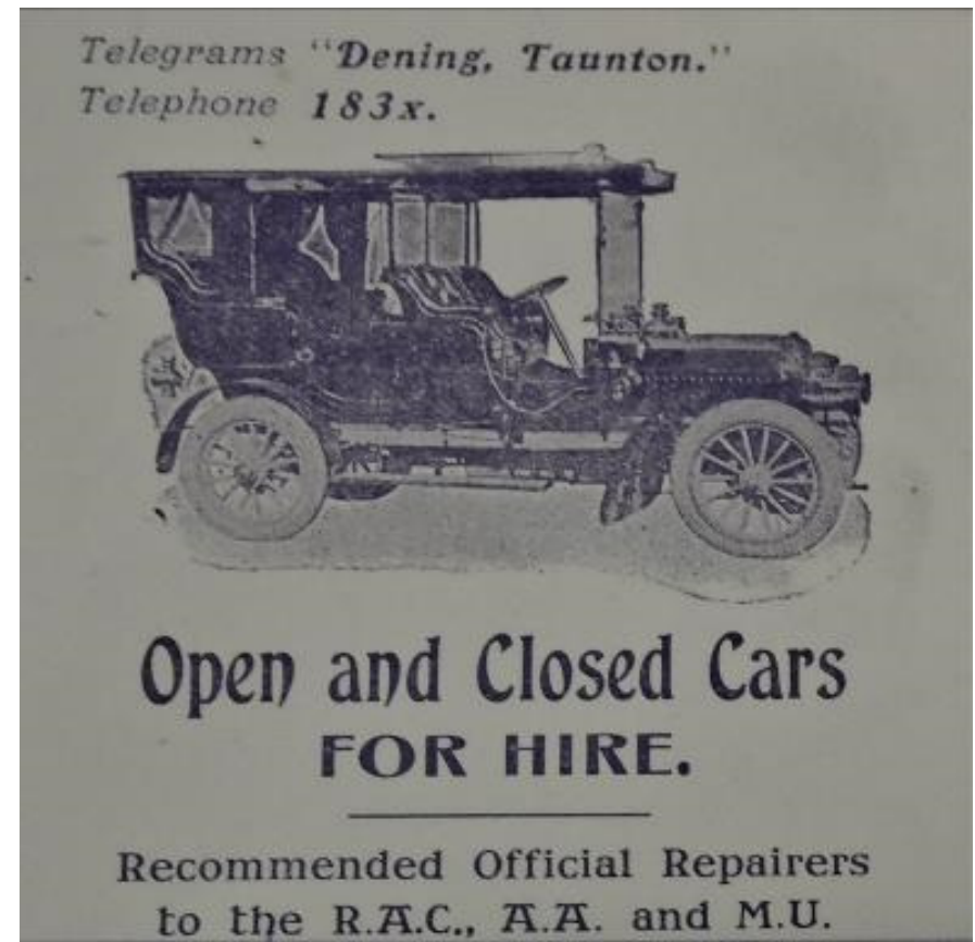
Billhead in use 1912-13