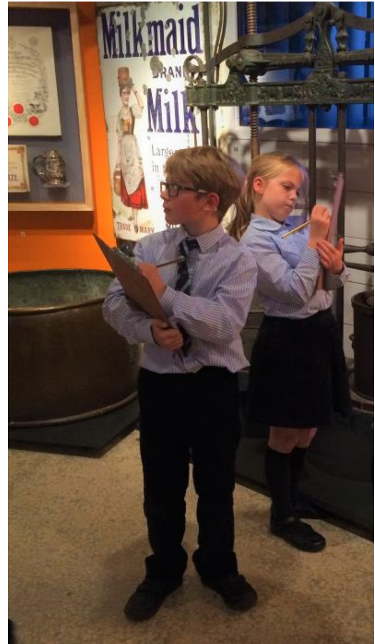
Discovering in the farmyard gallery

The museum collections are used to explore cross curricular subjects, and the Learning Team provides a range of resources to support teachers in preparing for a visit and embedding the learning back in school after a visit. Schools can also use a visit to the Somerset Rural Life Museum to broaden pupils understanding of the arts and achieve Arts Award Discover, a nationally recognised qualification.