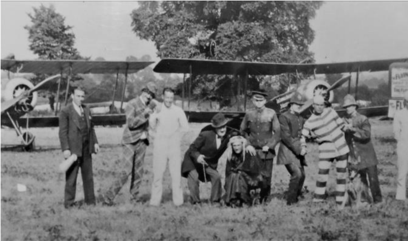
Flying Circus at Holway, Taunton, in June 1931