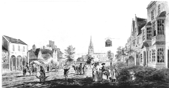
Witney market place c.1780 (VCH Oxfordshire 14)

The five volumes and two paperbacks published under the Oxfordshire Trust's auspices cover three market towns and over 50 other places across the county, stretching from Witney and Burford in the west to Henley-on-Thames in the south-east. Another 14 parishes (and counting) are available on the VCH Oxfordshire website, ahead of publication in their final form.