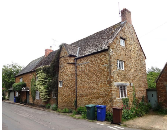
Hook Norton: one of the buildings being investigated with help from the Oxfordshire Buildings Record and Hook Norton Local History Group.

In partnership with Oxfordshire County Council and the Universities of Oxford and London a total of 19 volumes has been published so far. The complete history will comprise 23 volumes, published as hardback 'Big Red Books' and subsequently made available online free of charge. The Trust currently has to raise three-quarters of the project's annual funding by seeking donations from individuals, institutions and trusts.