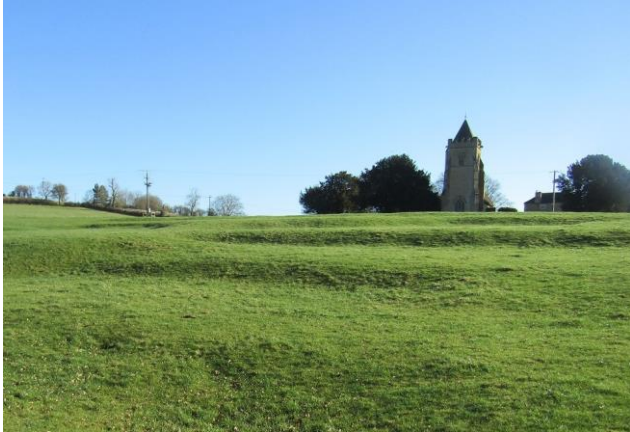
Earthworks west of Salford church, marking the formal gardens of the 17th- and 18th-century Salford House (demolished 1810)

Work on the rural parishes in this volume is now virtually complete, with five new drafts added to the VCH website (address overleaf). Those are Great Rollright and Little Rollright (the latter best known for the prehistoric Rollright Stones); Salford (named from an early medieval saltway running through the parish); Swerford with Showell (site of a riverside motte-and-bailey castle and medieval park); and a revised draft on Hook Norton (an Anglo-Saxon royal centre now best known for its brewery and its 19th- and 20th-century ironstone extraction, still visible in the landscape). Over Norton (historically part of Chipping Norton parish) will be added later.