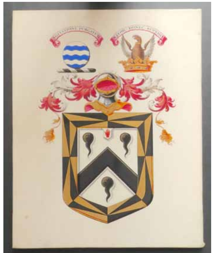
Russell coat of arms

Now in 2021 the cataloguing of every piece is complete, and thanks to Jill transcriptions of all the Latin documents have now been included. A feeling of minor triumph, after over two years hard work, was achieved when in the last box we came