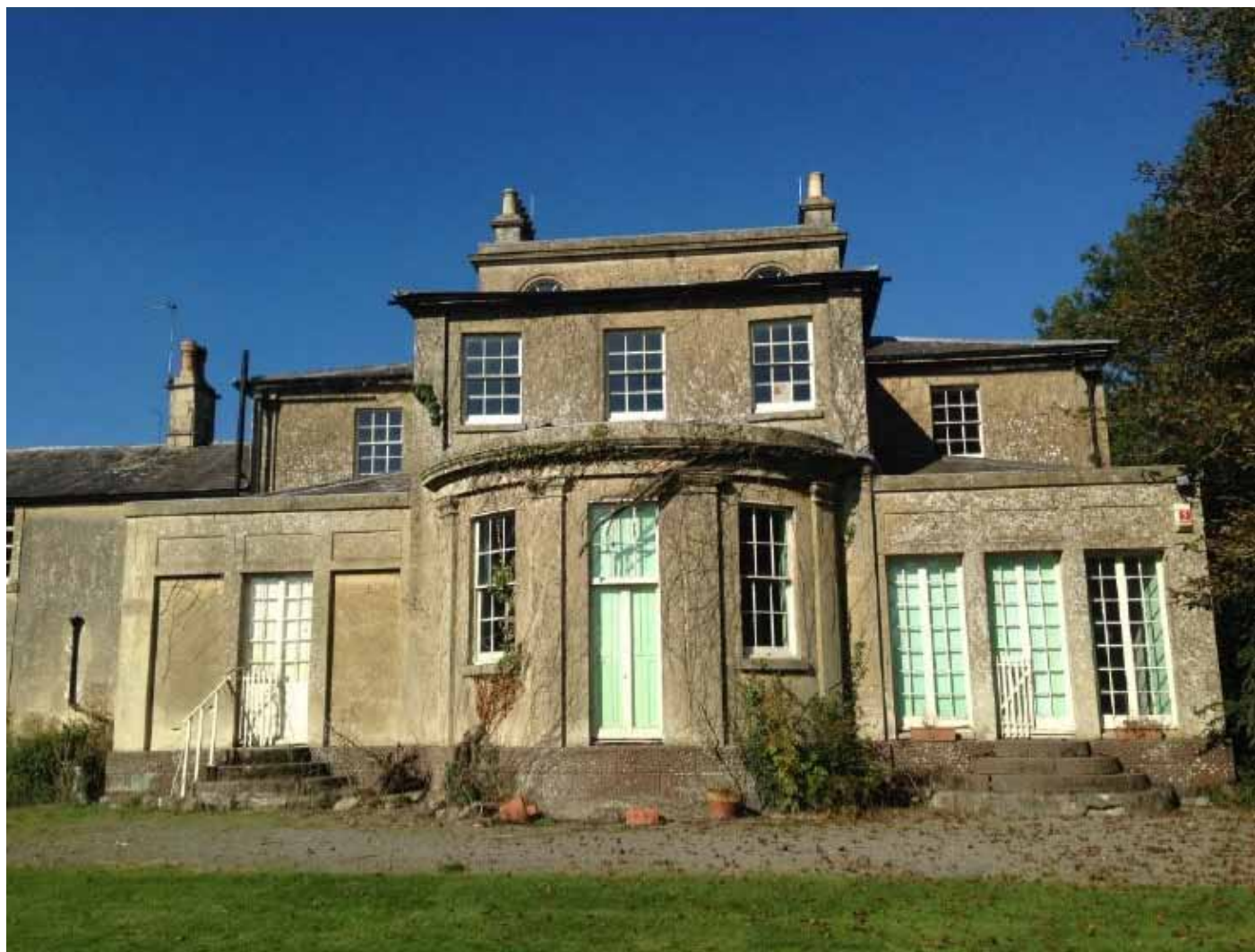
The former rectory, now Dodington Manor (Turley Heritage)

humour did not, apparently, land well with the census enumerator, who struck out these three descriptions with a heavy pencil!