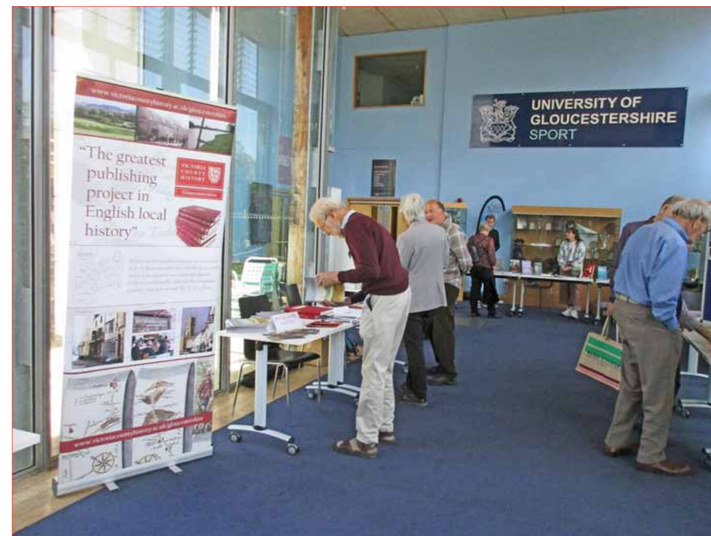
The Trust's stand at Oxstalls on 14 May