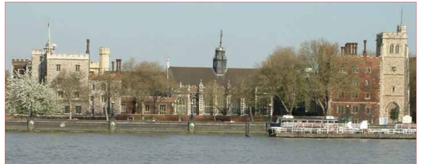
Lambeth Palace (CC BY-SA 3.0)

There are a number of things I enjoy about working for the VCH. Few other jobs would enable me to justify poring over historic maps for a whole day as essential work, for instance. Working with original documents from centuries ago is a genuine privilege, and it is a joy reconstructing the history of our parishes, handling the documents they left behind and piecing together the details of quotidian life in communities across the county. For this reason, some of my favourite classes of manuscripts are those, like legal depositions, in which we can hear the voices of individual parishioners centuries earlier, or those, like churchwardens' accounts, which hum with the rhythms of daily life and seasonal change. Another pleasurable element is the requirement to travel from time to time.