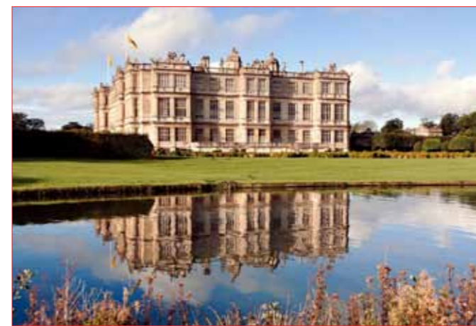
Longleat

So the obvious question is, where will my travels take me next, but I already have an answer to that! The archivist at Longleat has been in touch to say that they are finally re-opening after a long period closed to the public. Better yet, she tells me that they have just discovered a previously unknown survey of Bagendon from the 1660s, so I'm looking forward to studying that. Although I haven't been to Longleat for VCH Gloucestershire, I previously spent a lot of time working there when I was working for VCH Wiltshire, so I'm quite familiar with it. It must be one of the most attractive archives in the country, and perhaps the only one where you might have to crouch out of sight on the back stairs of the house, next to a member of staff dressed as 'the ghost', waiting until they have dutifully jumped out at the passing tour