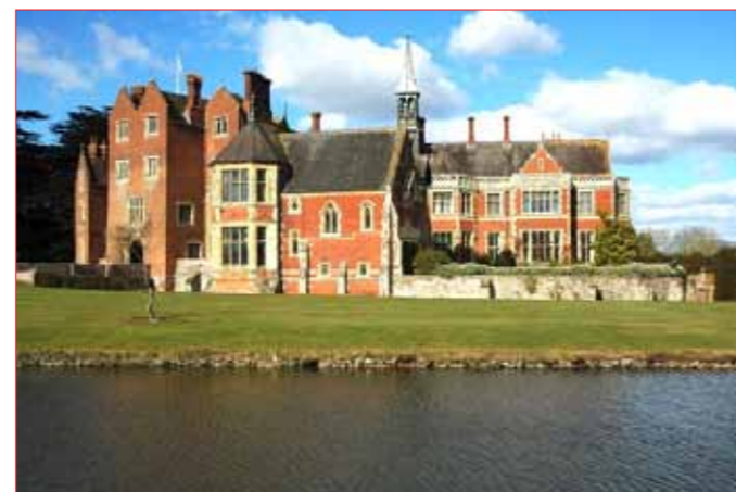
Madresfield Court

Whilst Corpus Christi's quad is undoubtedly attractive, none of the archives I have listed above can compete for splendour or romantic appeal with Madresfield Court, a moated manor house that is still a private home, albeit one that boasts a well-equipped archive in the cellar. The house is owned by the Lygon family, whose ancestors also held the small manor of Redgrove near Cheltenham, and their archive helped us to fill some important gaps in the history of 16th-century Cheltenham. It was also a tremendous privilege parking my car right next to the moat, crossing the drawbridge, and being given the key to the strongroom, and told to look at whatever I wanted to.