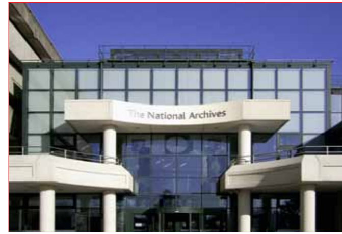
The National Archives at Kew (CC BY-SA 2.5)