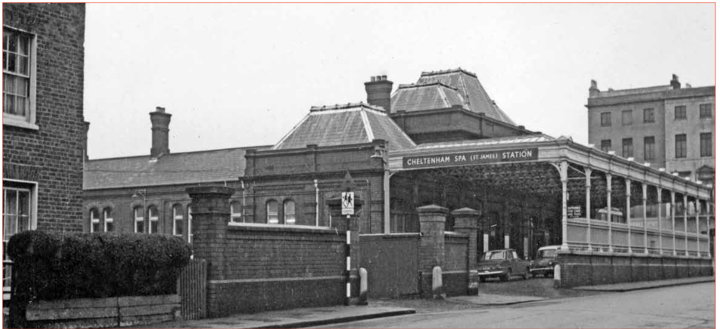
St James station (David Aldred)

Secondly, St James railway station had been opened in St James Square in 1894. I was there on the evening of 1 January 1966 to witness the departure of the 22.15 train to Gloucester which marked the station's closure. Today Waitrose stands on much of its site.