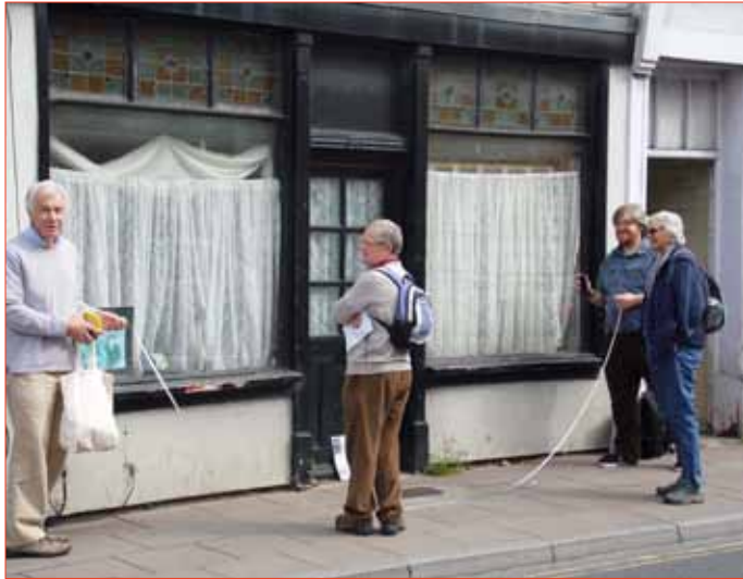
Members of the academy check the width of a medieval burgage plot in Cheltenham's Lower High Street

Alongside work on the settlements, volunteers have begun research on other sections of the history.