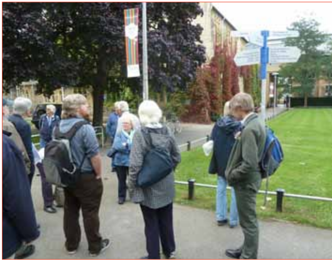
Later in the day they visited Francis Close Hall