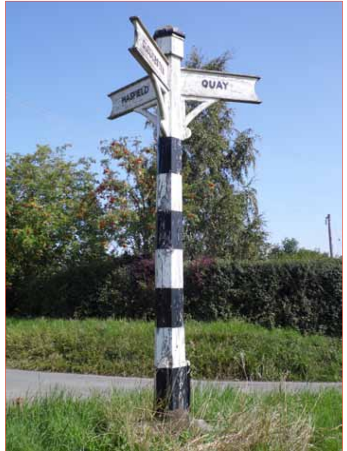
Ashleworth sign post