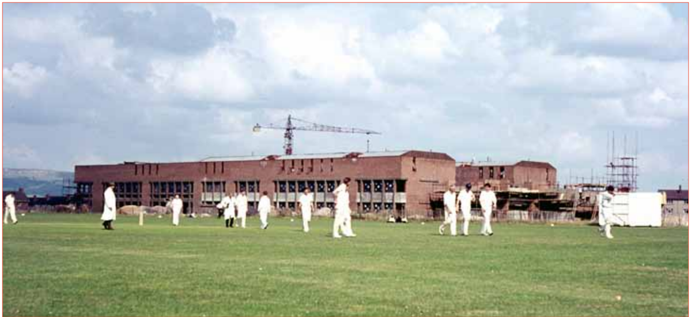
The 1965 grammar school under construction (David Aldred)

There were three persons concerned ... one was a black bull fac'd man with strait hair about 5 feet 4 inches fresh coloured & had on brown cloaths.