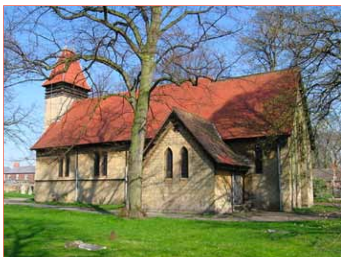
St Luke's parish church, Whaley Thorns, which was financed by the Bathurst family