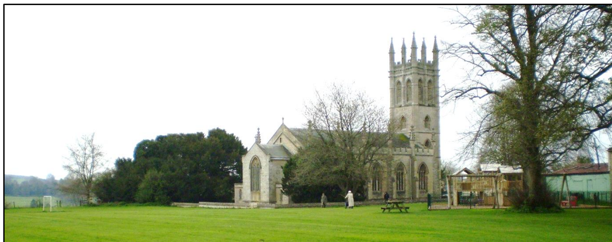
Churchill parish church (built 1825–6) from the north-east.

Introduction: Landscape, Settlement, and Buildings