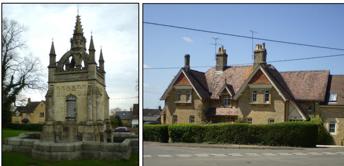
Village fountain of 1870 (left) and cottages dated 1885 (right).

The gargantuan Gothic fountain commemorating Langston was commissioned by his daughter Julia in 1870, designed probably by Henry Woodyer. A crocketed spirelet carried on four flying buttresses sits atop a squat square tower with an embattled parapet and corner pinnacles, decorated with a band of armorial shields above a dedication in Gothic script. Woodyer may have also built the neighbouring reading room (now village hall), dated 1870, which retains an elaborate doorway beneath an ogee-crocketed hood and finials, although the gables with crocketed pinnacles which formerly adorned the building's large mullioned-and-transomed windows have since been removed. 99 A memorial to the geologist William Smith (d. 1839), comprising a large monolith of local oolite on two square steps, was erected on the nearby roadside by Julia's husband Henry Reynolds-Moreton, 3rd earl of Ducie, in 1891. 100 Village estate houses built for the earl include a nearby pair of cottages with tile-hung gables (dated 1885), a pair in Hackers Lane (completed the following year), and two pairs with timber-framed gables dated 1901. In 1879 Ducie also commissioned George Devey to build an 'elaborate railway inn' adjoining the station, the resulting Langston Arms Hotel (now a care home) featuring multiple gables, a jettied first floor, and tall red-brick diagonal chimneys as part of a complex design in free Tudor style. 101