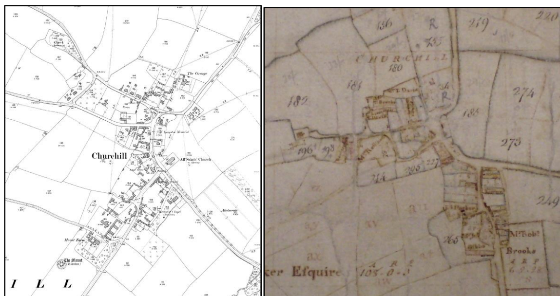
Churchill village in 1788 (left) and 1899 (right). The medieval church is on the north-western edge of the village, next to no.196 on the 1788 map. Hastings Hill runs west–east to join the main north–south Chipping Norton road. Detail of 1788 map from OHC, Lo. VII/1; OS Map 1:2500, Oxon. XX.1 (1899 edn).

were added further north again in 1870, and the war memorial (by the roadside to their north-east) in 1923. 71 A new rectory house was built south-east of the church in 1923–4. 72