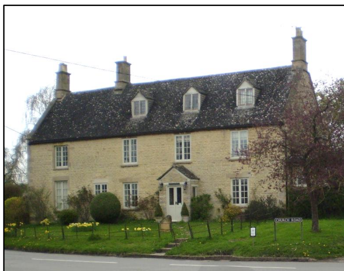
Corner House (18th- or 19th-century with medieval building fragments possibly in situ in the cellar).

(18th- or early 19th-century) building. Fragments of a 14th-century doorway survive reset in ground-floor fireplaces, and a total of 115 decorative medieval floor tiles were found in a floor underneath the current stairs. Like the remains of a 14th-century doorway re-used in nearby Hastings Hill House, some or all of those items could have come from the church upon its demolition in 1825, but nevertheless raise the possibility (along with the cellar window) of a high-status stone-built medieval dwelling on the site. 87