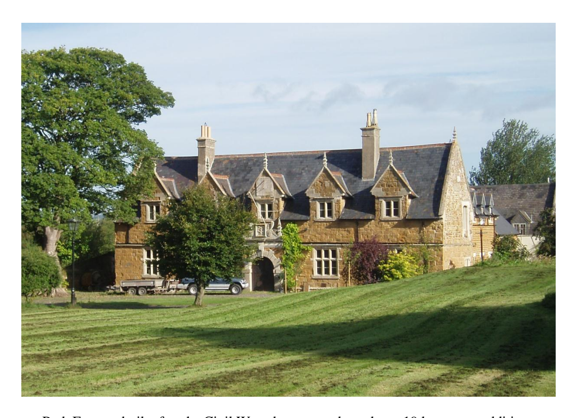
Park Farm, rebuilt after the Civil War; dormers and porch are 19th-century additions

in 1603. 14 The nineteenth-century central dormer has the date 1629 carved in the stonework, which could have come from the original building. It is probably on the site of the former priory, as Nichols advised. 15 It is likely that the materials of the priory were re-used in the construction of the mansion and the wall of the surrounding park. According to Nichols the old manor house itself was dismantled in 1756 and the material used in the construction of Baggrave Hall.<sup>16</sup>